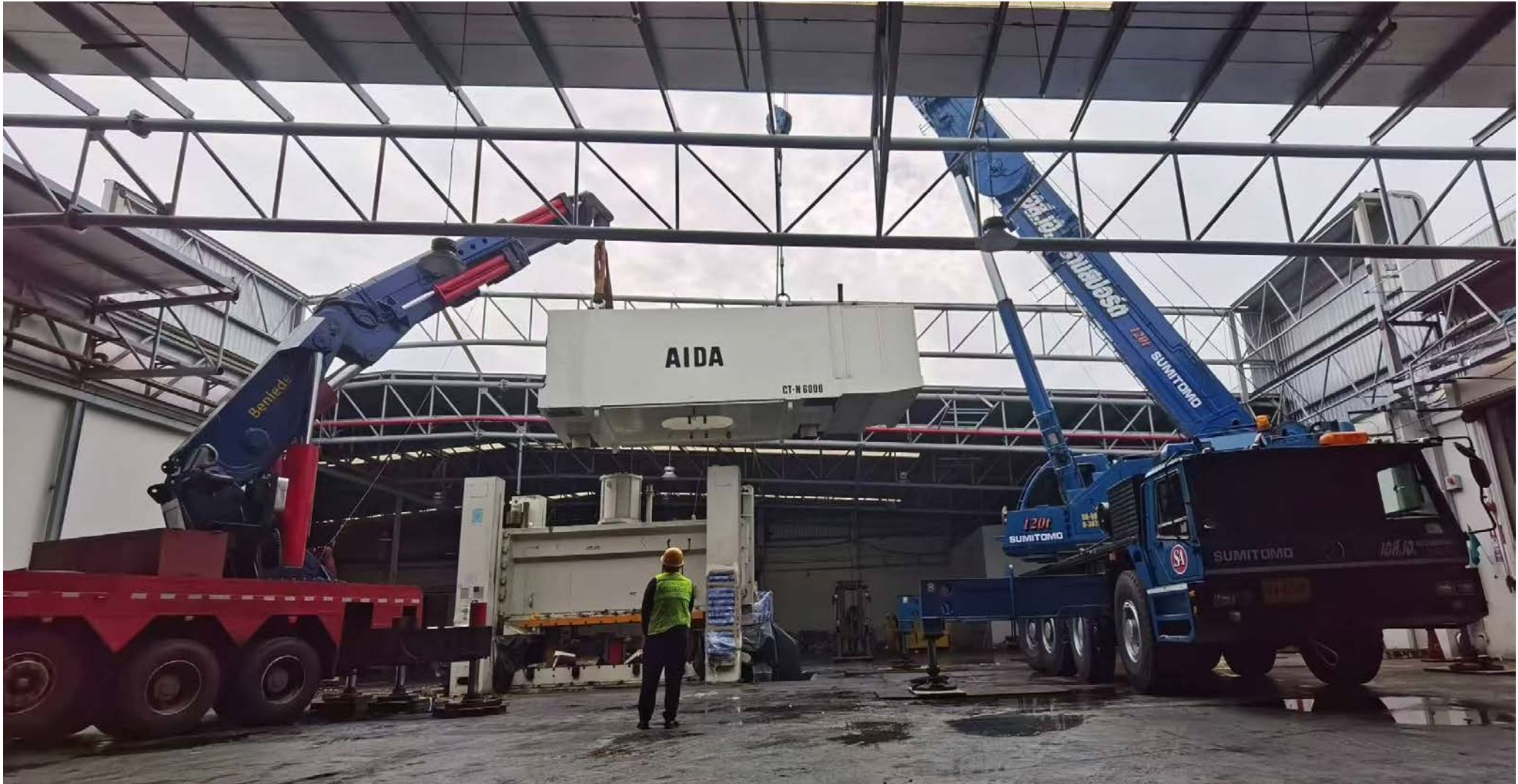
Dis-assembly 600 Ton Aida Press Model : CT-N-6000, Total Weight : 157 Ton