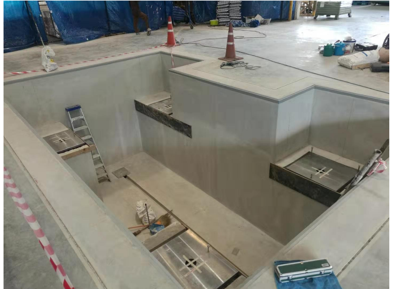
Foundation Pit for Seyi 600 ton Press