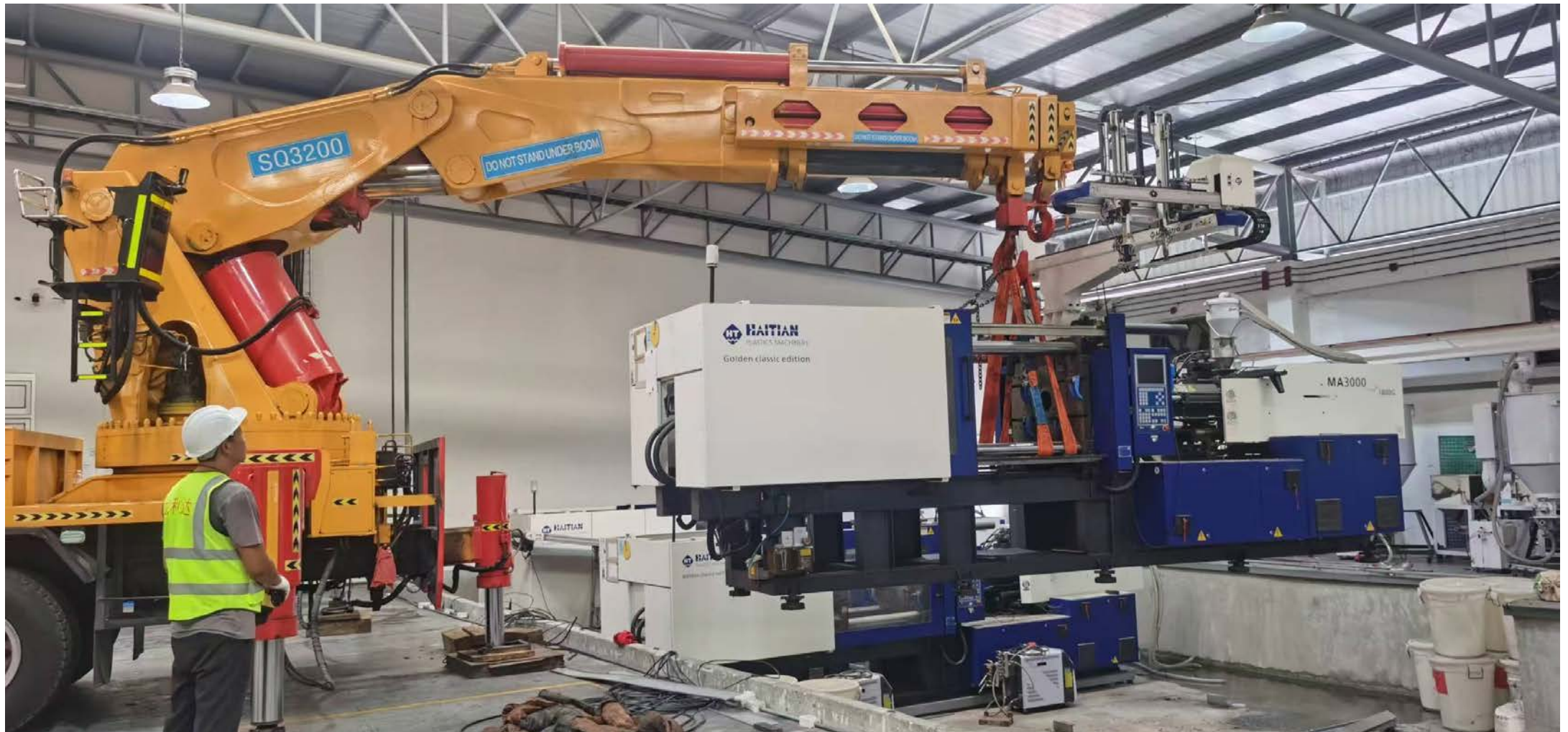
300 Ton Haitian Injection Machine. Weight: 12 ton