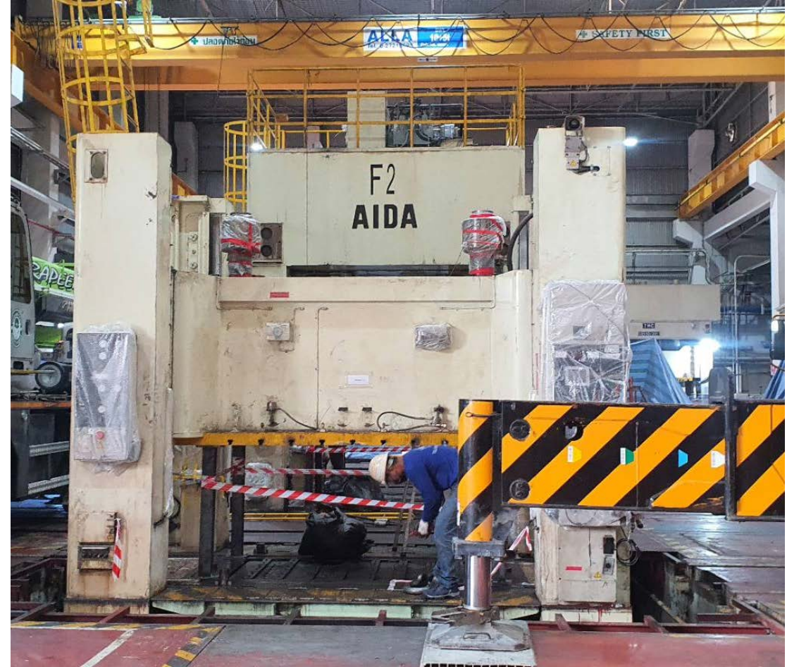
Disassembly 600 Ton Aida Press Model : SMX-6000. Total Weight : 136 Ton