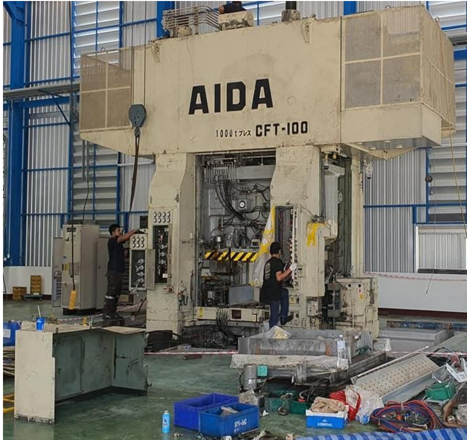
1000 Ton Aida Press Model : CFT-1000