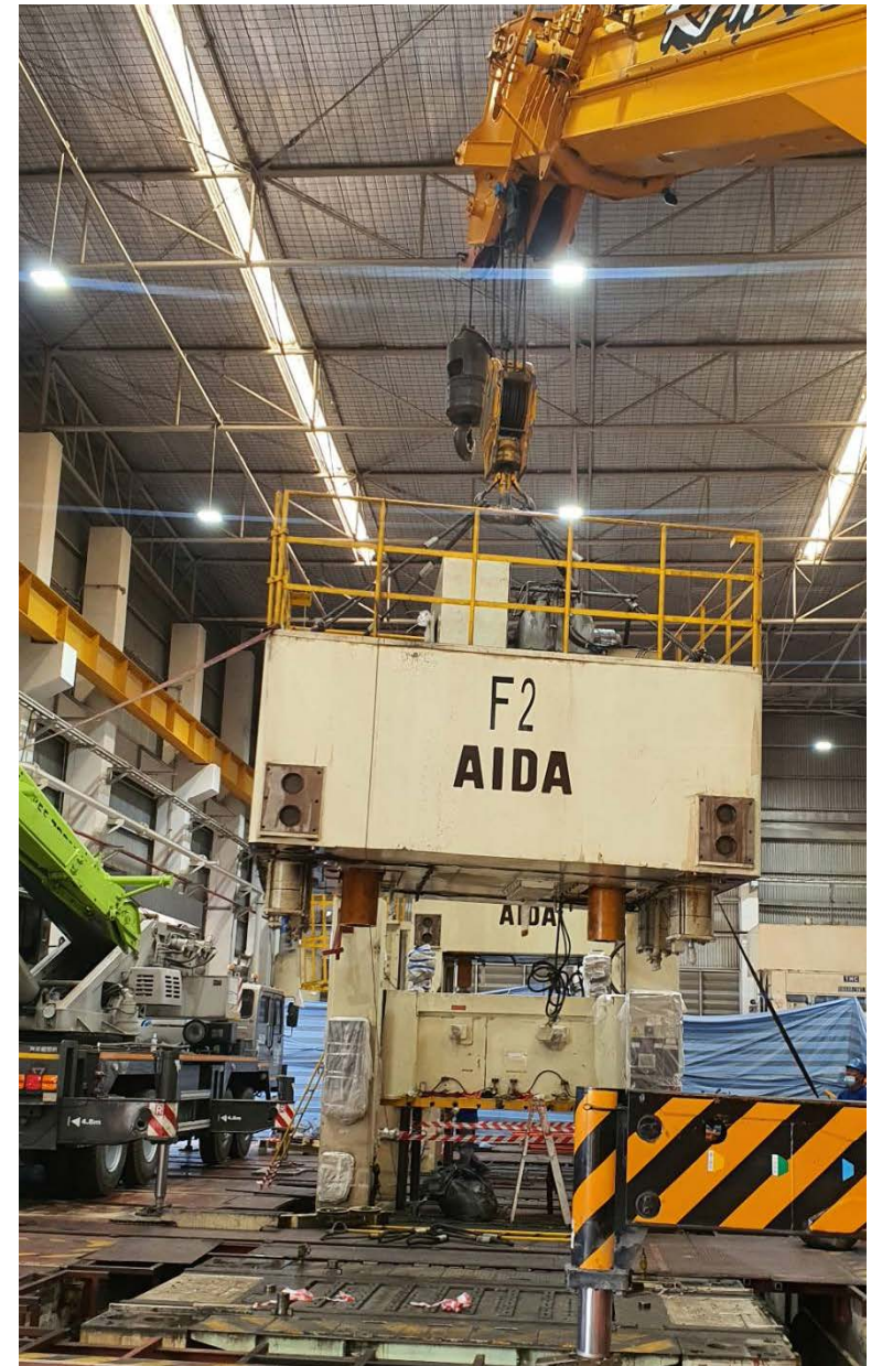
Disassembly 400 Ton Aida Press Model : SMX-4000. Total Weight : 82 Ton