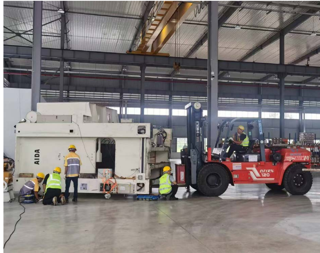
Installation 300 Ton Aida Press Model : NS2-3000, Total Weight : 45 Ton