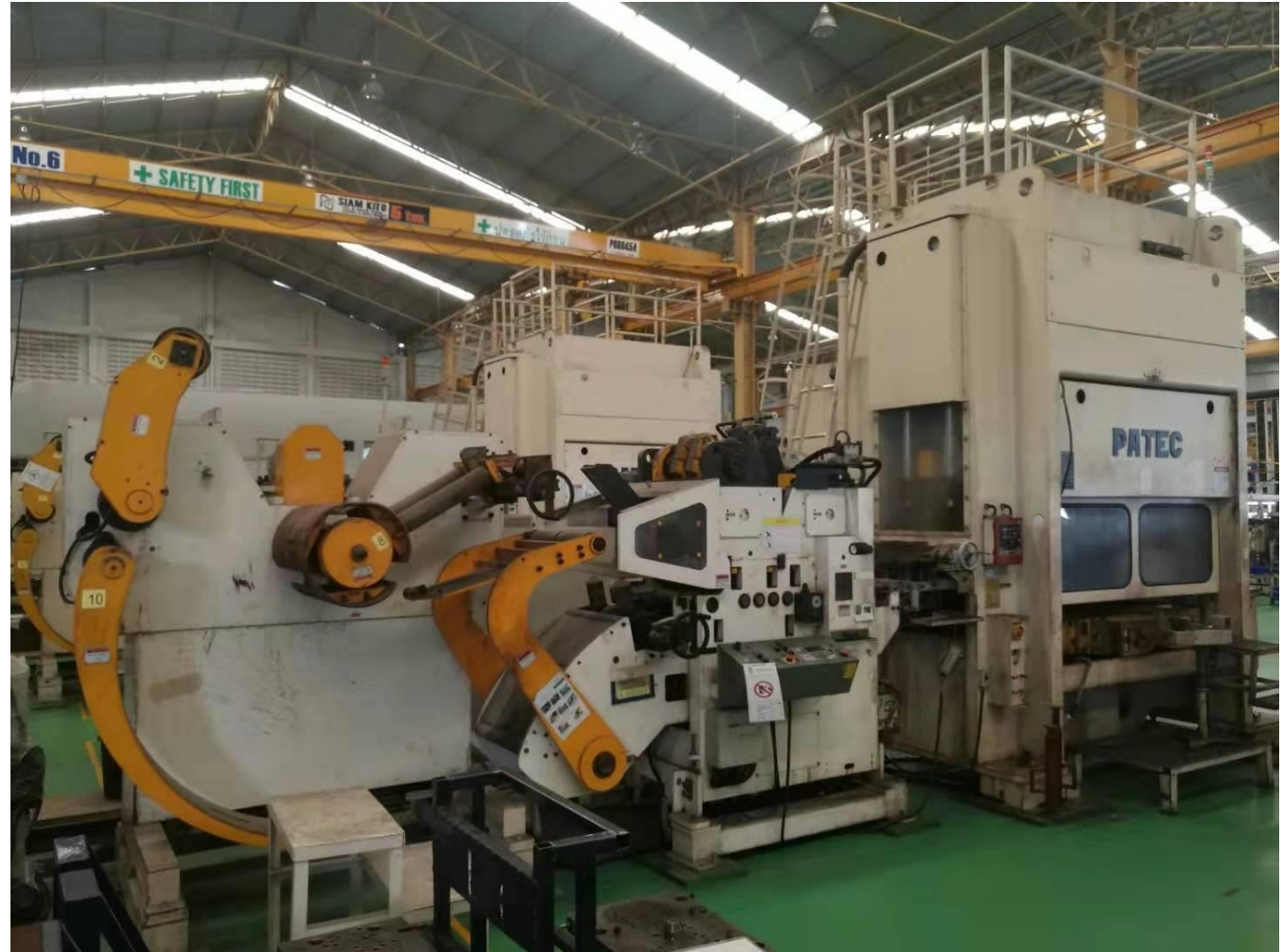
600 Ton Patec Press (Bolster 2100 x 100 mm) Machine Weight : 68 ton Orii 3-in-1 Leveller Feeder (max thickness : 9.0 mm. Width : 600)