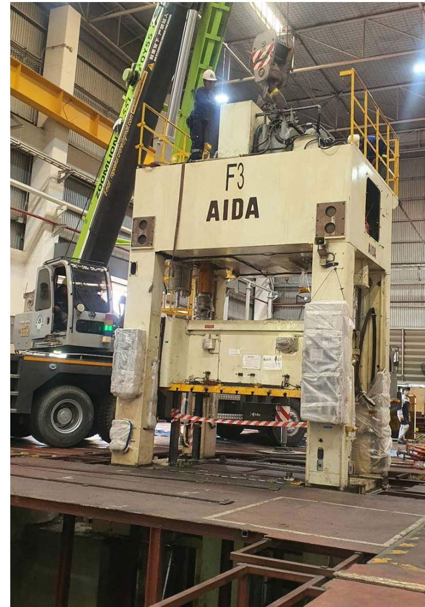
Disassembly 300 Ton Aida Press Model : SMX-3000. Total Weight : 64 Ton