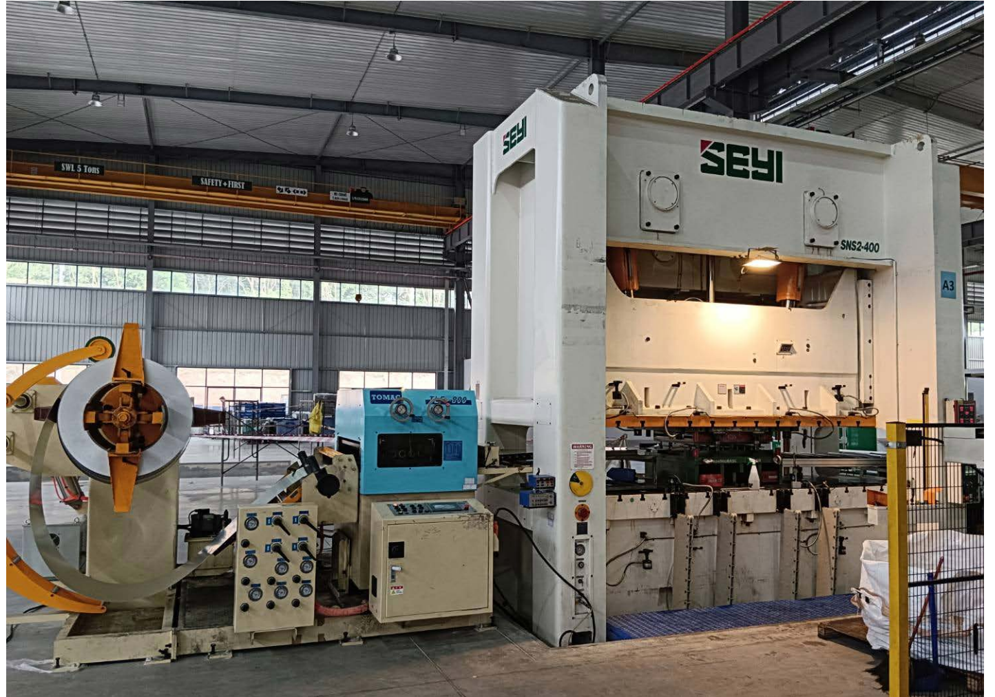
Installation 400 Ton Seyi Press Model : SNS2-400 (Bolster 3400 x 1100 mm). Weight : 54 Ton