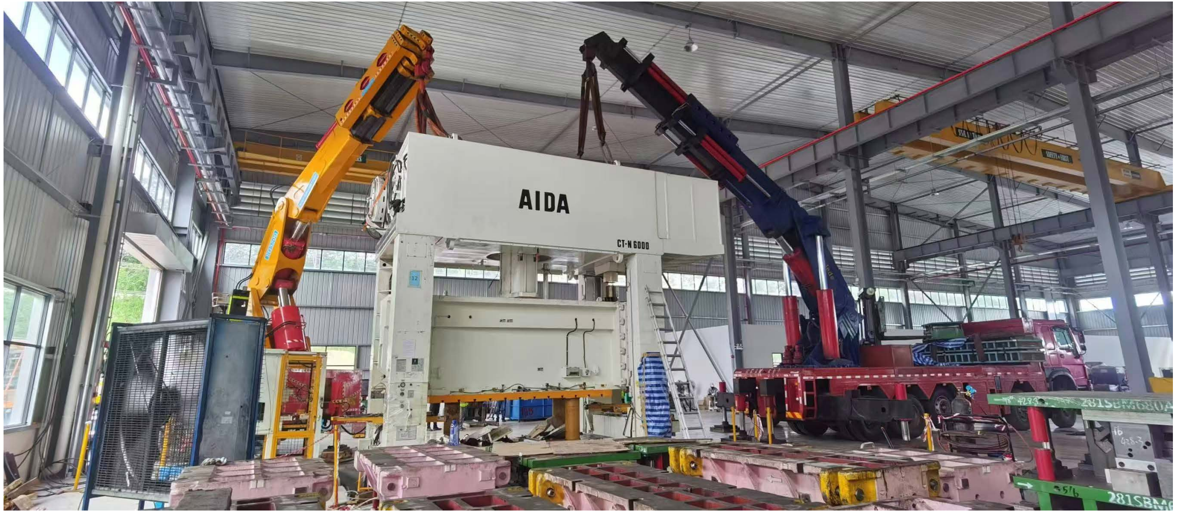
Assembly 600 Ton Aida Press Model : CT-N-6000, Total Weight : 157 Ton