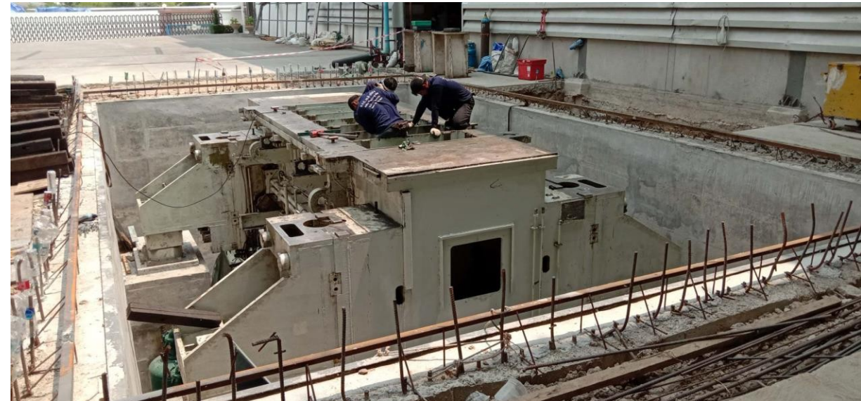
Foundation Pit for Komatsu 1700 ton Press