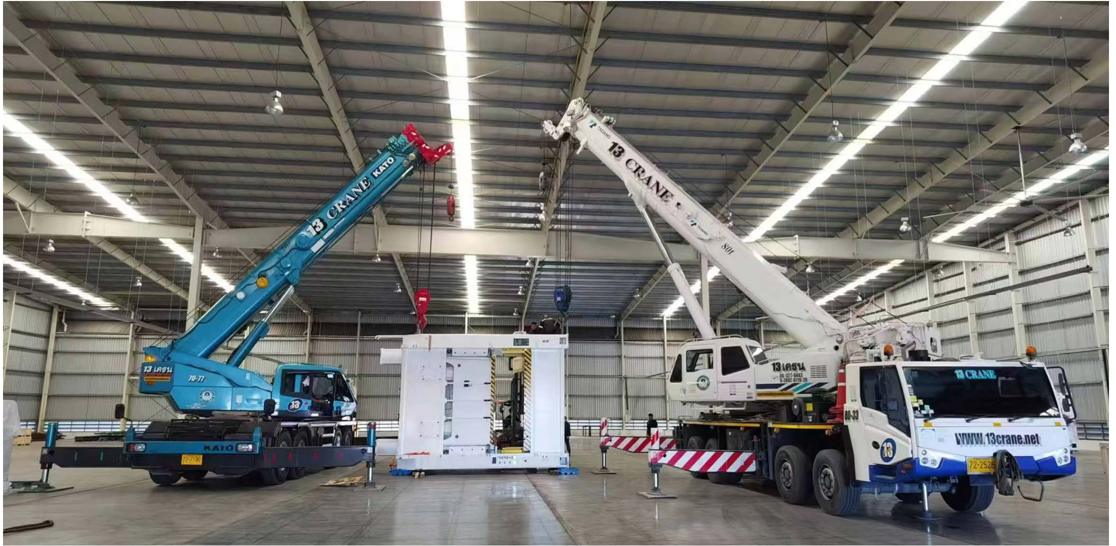
Installation of 500 Ton Yangli Press, Machine Weight: 65 ton