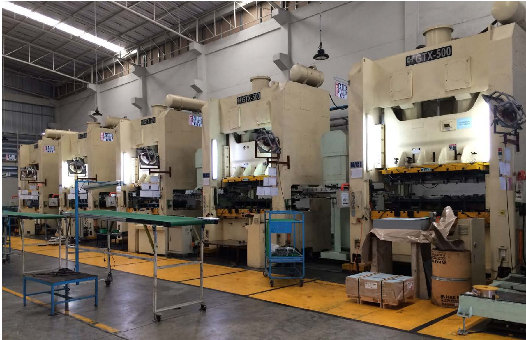
Installation of Chin Fon 500 Ton Press + Lee Yih Shuttle Robots