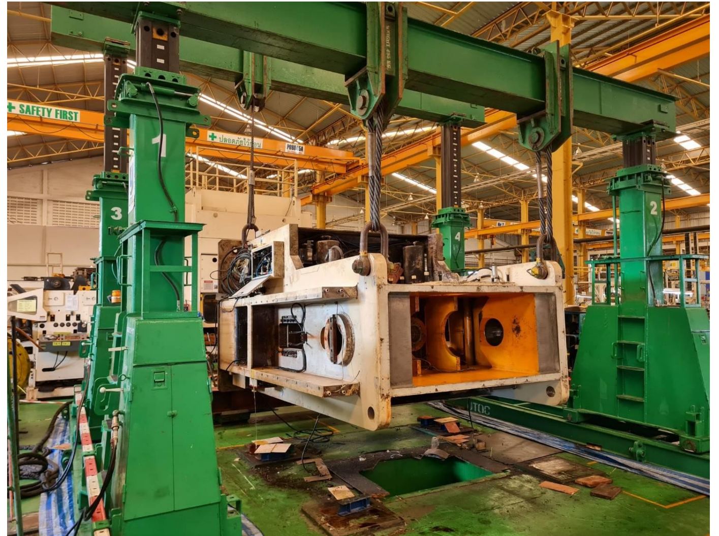
Disassembly 600 Ton Patec Press (Bolster 2100 x 1000 mm) . Machine Weight: 68 ton