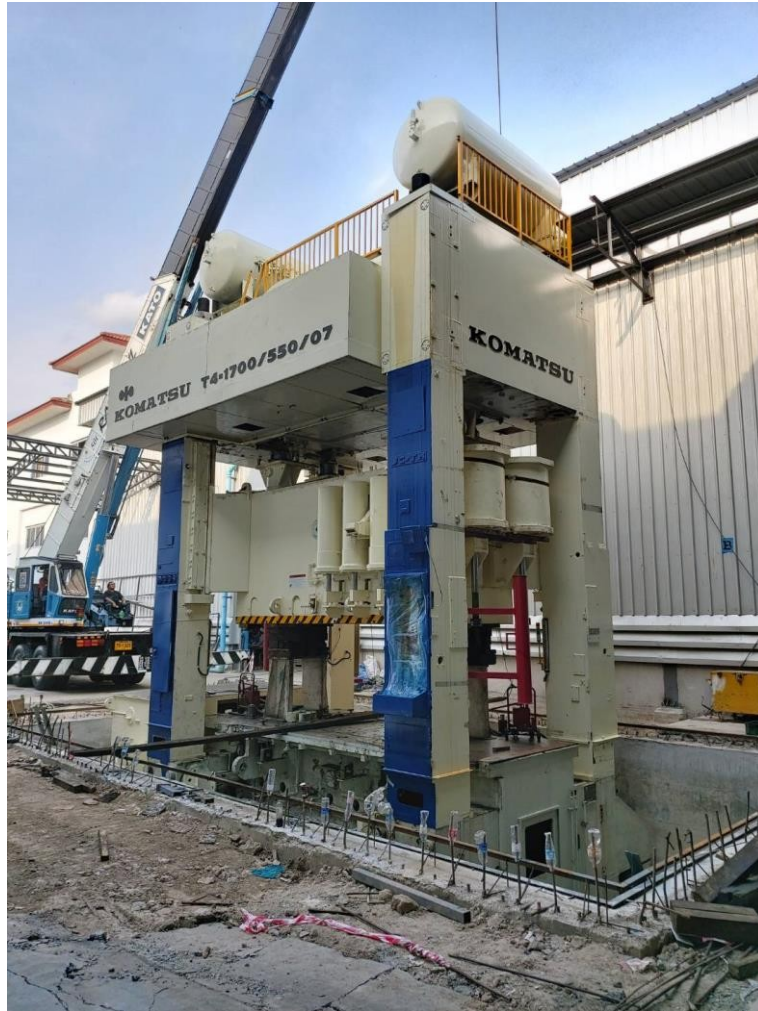
1700 Ton Komatsu Press Total Weight : 565 ton