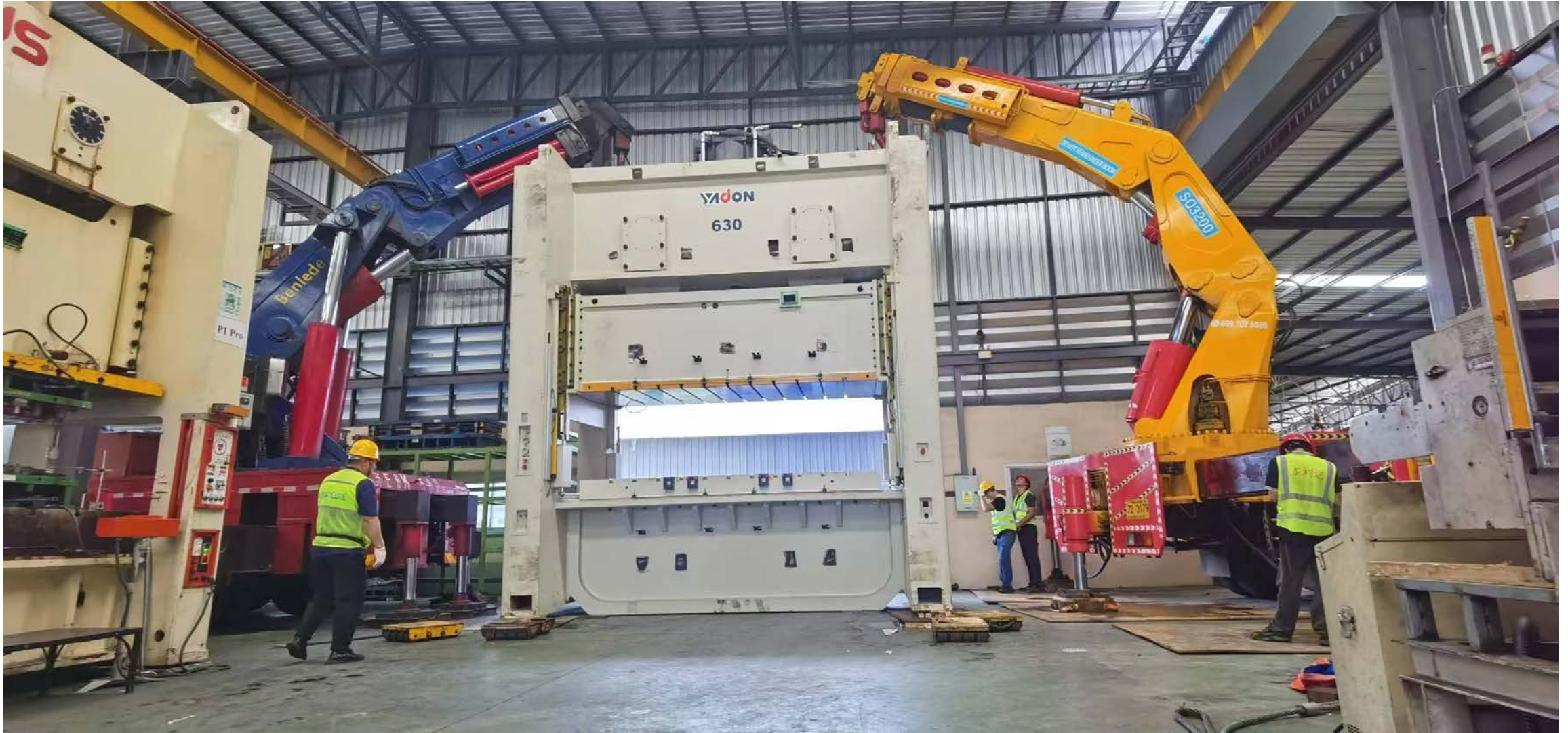
Installation of Yadon 630 Ton Press. Machine Weight: 121 ton